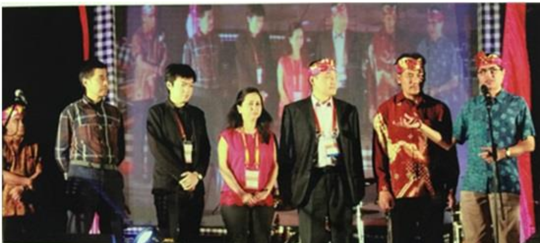
Inauguration of the APBA during the Gala Dinner, and introduction of the new APBA President and Executive Committee